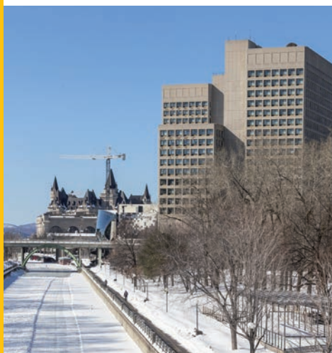
Ottawa: The 1st international conference for health promotion of the World Health Organization in 1986 took place in Ottawa.