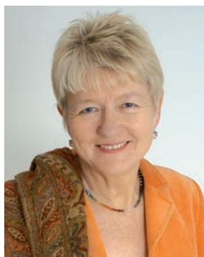
Ilona Kickbusch: "It was especially important for us to have the widest possible participation."