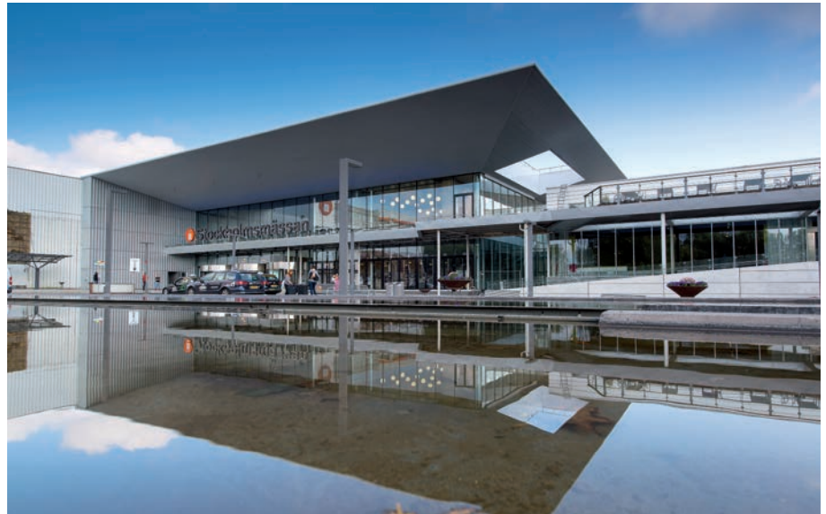
The tenth EPH Conference will take place in Stockholm's exhibition centre.

also currently increasing: from yoga institutes to private clinics. This will be considered under the following sub-theme: "From public to private, from collective to individual: How can public health systems adapt to a changing world?"