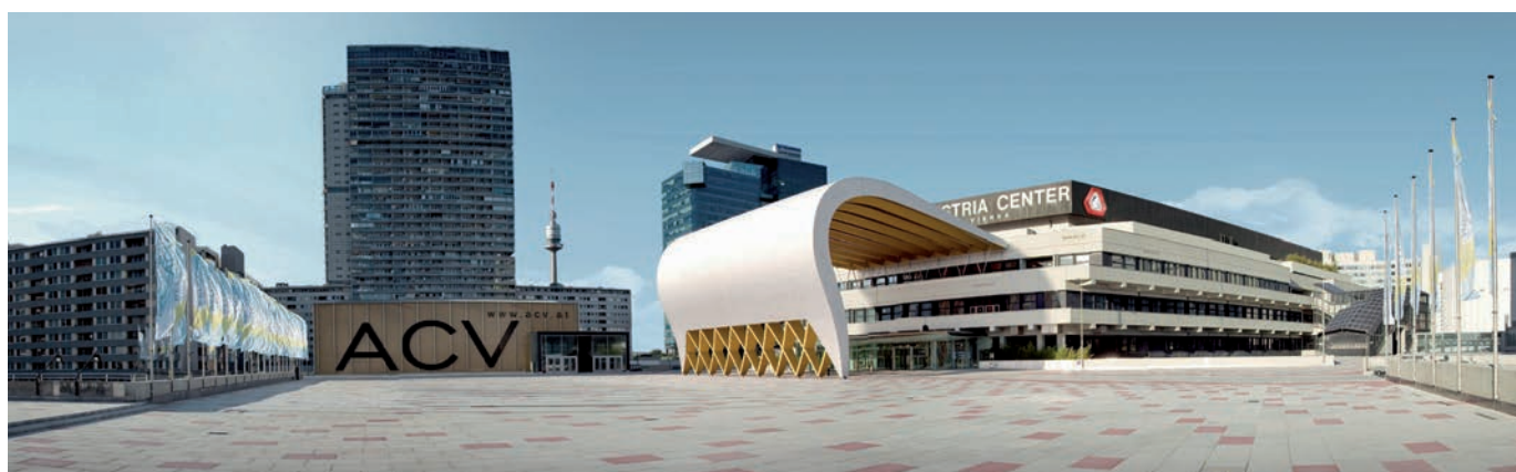
The 9th European Public Health Conference is taking place in the Austria Center Vienna.

The 9th European Public Health Conference in the Austria Center Vienna has 16 thematic tracks that cover the broad range of public health issues in Europe.