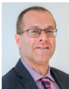
Hans Kluge: "We know that even in richer countries, the amount spent on public health is far lower than it ought to be."